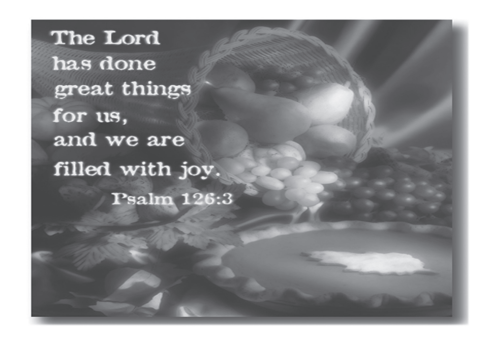
The Cathedral Ladies Philoptochos Society presents their annual