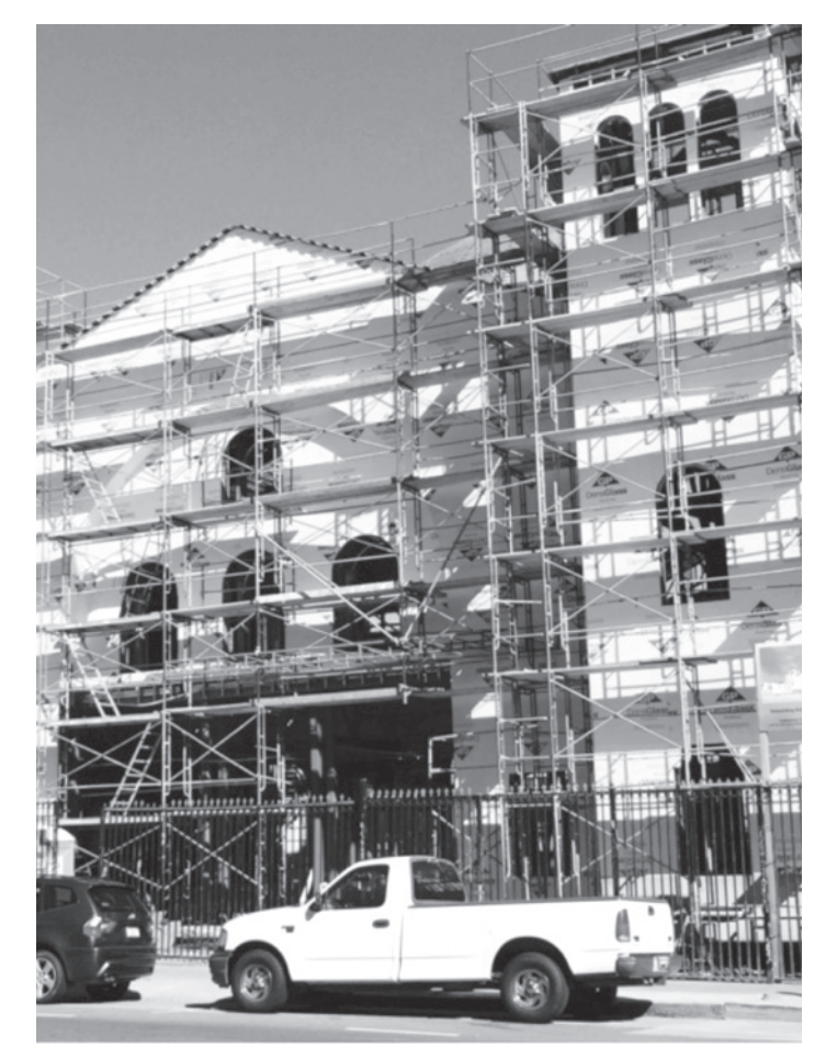
From the exterior, a little like the old Annunciation! Notice the windows and the central peak. Even the towers, for those who remember the bell towers before they were taken down in the 60s. In any case, the exterior is thoroughly Byzantine. It is typical of Orthodox churches built between the 4th and 9th centuries. The interior is something else. Like Orthodox worship itself, it must be experienced.