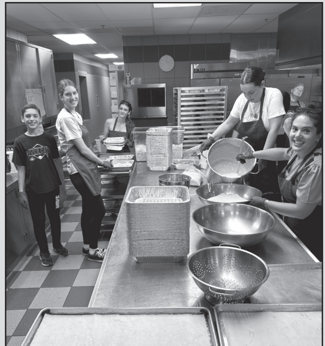
Rev mata and To Mellon helping out with Festival food Preparations

To donate now, or set up a pledge for future payments, visit www.annunciation.org/match