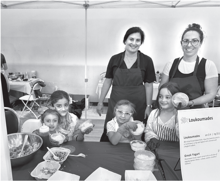
Orama helping out at the Loukoumades booth