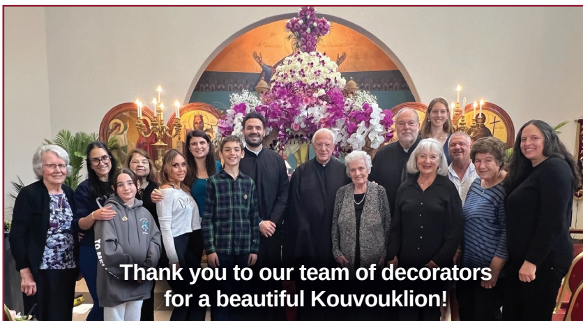
Thank you to our team of decorators for a beautiful Kouvouklion!