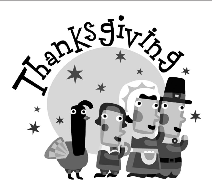
The Cathedral Ladies Philoptochos Society presents their annual