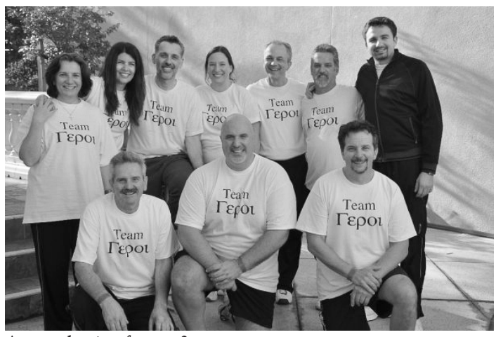
Are we having fun yet?