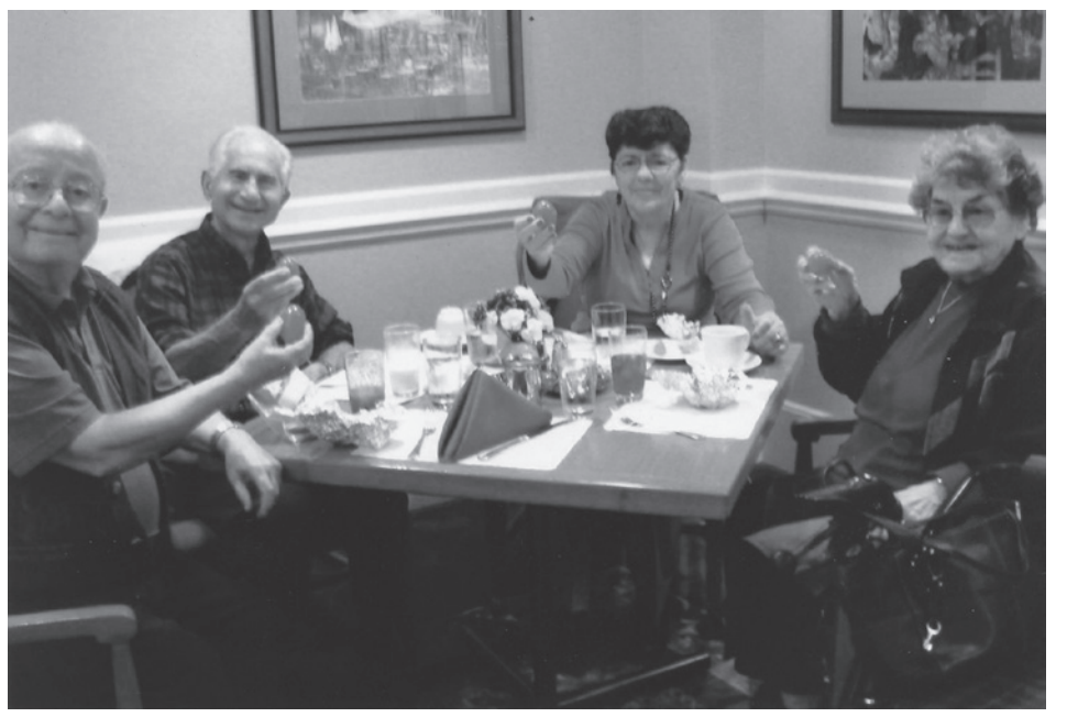
Community Link members visiting parishioners in an area convalescent facility.

We invite your presence and participation.