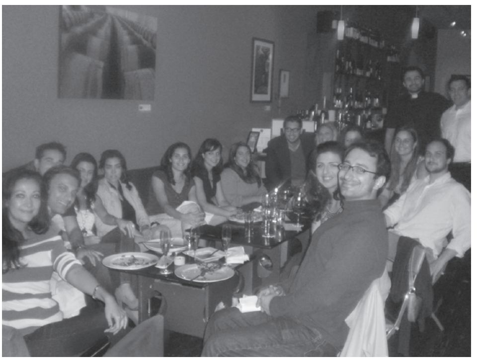
A night out, with good food and fellowship, a monthly tradition.