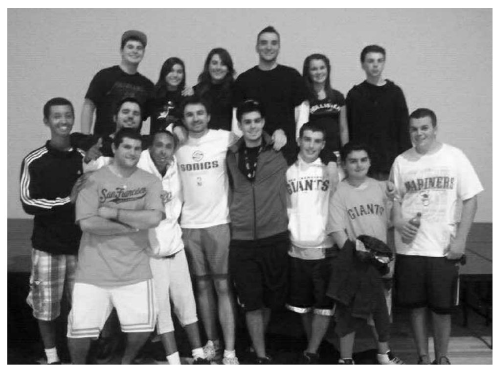
Our Cathedral GOYA after our dodgeball game November 15