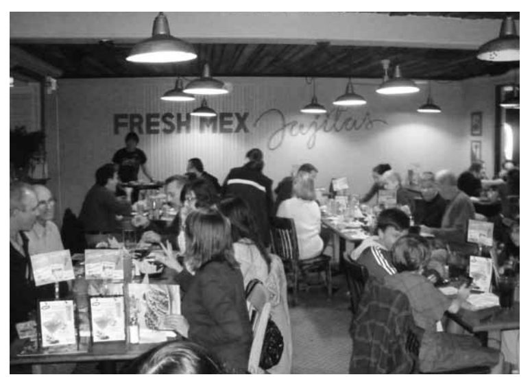
Cathedral JOY Members and their parents supporting our youth groups!