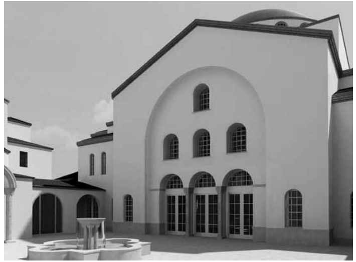
Exterior view from the courtyard