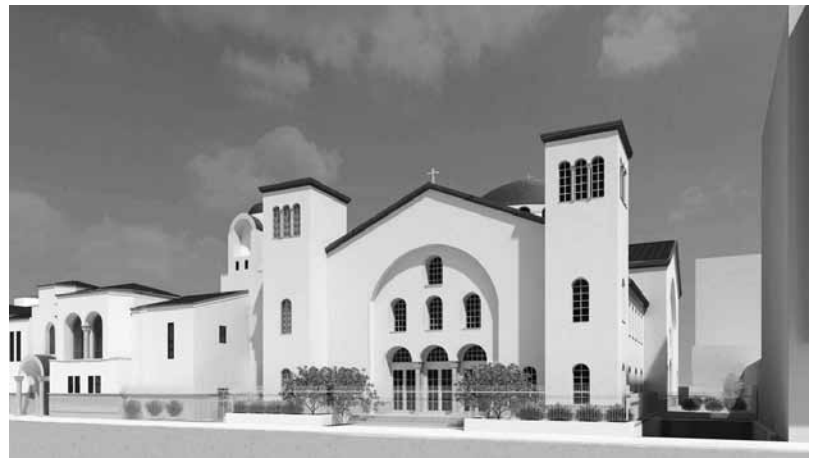
Exterior view, looking east from Valencia Street