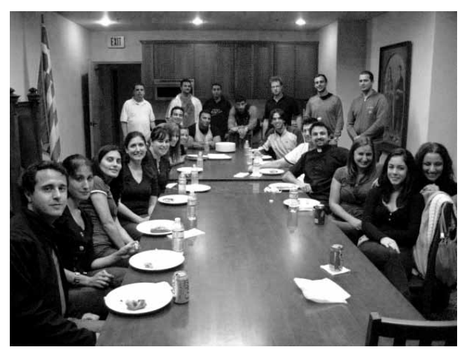
September: "Our Cathedral Young Adults enjoying a meal in the conference room, after helping set up for the festival in 2009."

Our Young Adult group is open to any young adult of the Cathedral from ages 18-35.