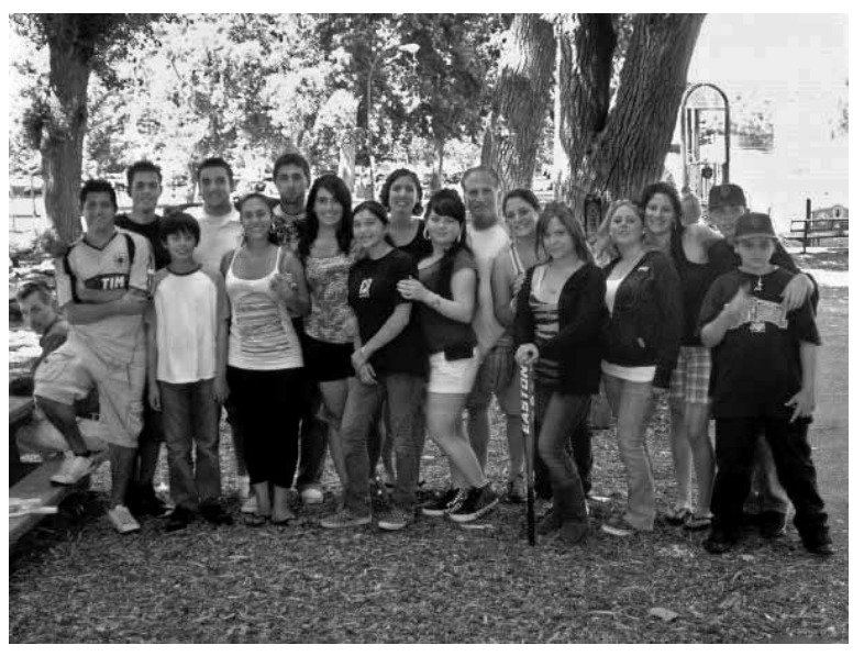
GOYA: "Our GOYA group from last year's BBQ/softball game in San Bruno Park"

Our Cathedral GOYA (Greek Orthodox Youth Association) is open to all youth from grades 7-12. Hope to see you soon!