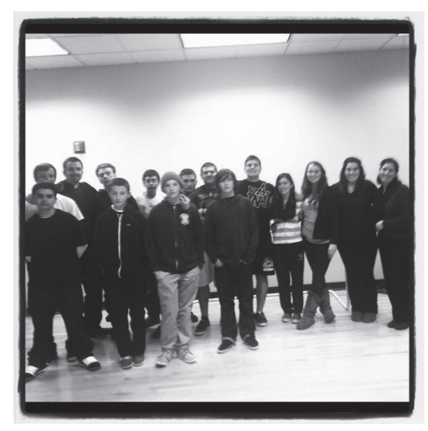
November 2011: Our Cathedral GOYA on November 14, right before playing indoor soccer in the gym.

The bookstore is an urban ministry, which was referred to in the homily on November 27. As we heard in church that day, this very special ministry is a beautiful form of stewardship, and is worth being promoted and supported, however possible, within our parish and all parishes in the Bay Area. Please continue to keep reading the Sunday bulletins and the Cathedral Herald for upcoming news and information on how our parish can help contribute to this program.