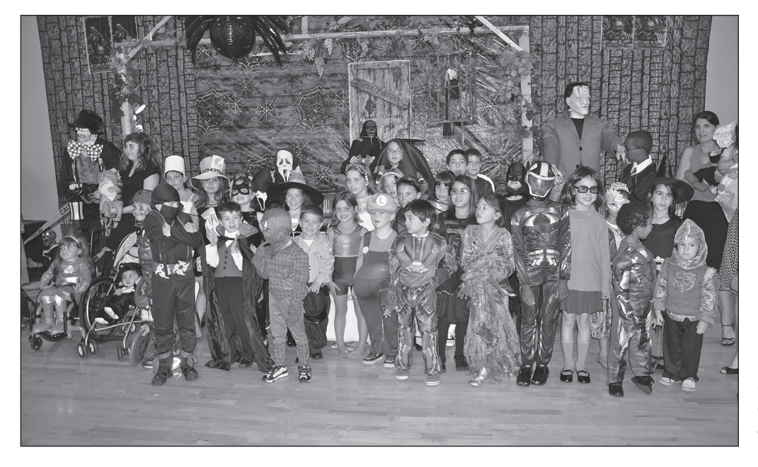
Some of our adorable kids in costume on October 30, for the Sunday School costume parade.