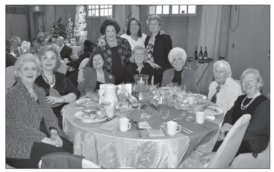
Some of our Philoptochos Ladies enjoying the luncheon to benefit the seminary.