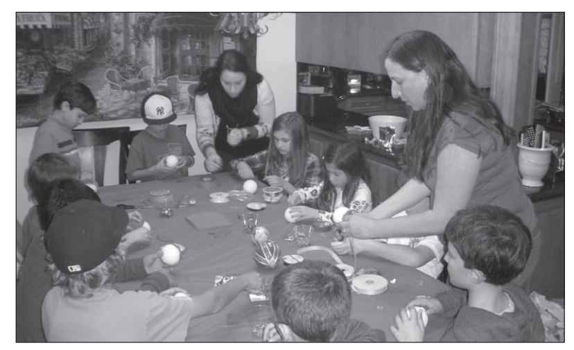
Our JOY kids working on their Christmas ornaments

JOY is open to all youth grades 3-6. Hope to see you there!