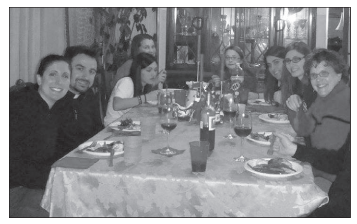
Merry Christmas from our GOYA!

A reminder that GOYA is open to all youth grades 7-12. All are welcome to join us!