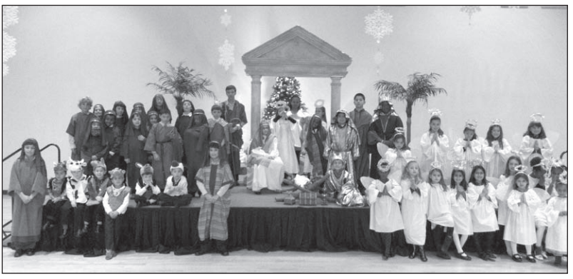
Congratulations to all our Sunday School kids and teachers!