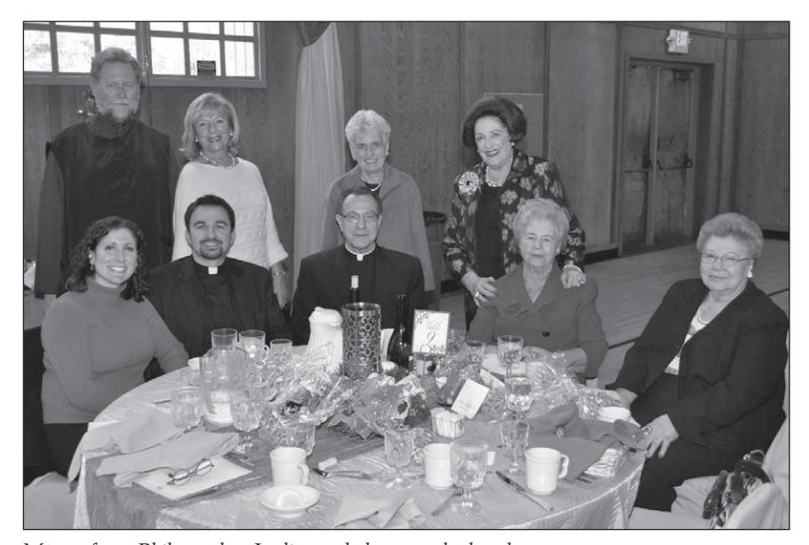
More of our Philoptochos Ladies and clergy at the luncheon.