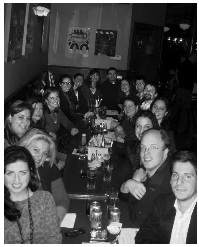
December 2011: Some of our young adults from their Kris Kringle Gift Exchange/Dinner in December