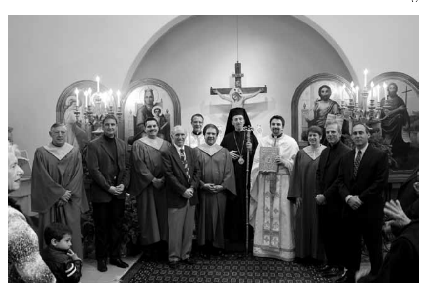
This year's new members of the parish council taking the oath of office and being sworn in on January 8.

Please feel free to bring names of any loved ones who have passed on from this life, and kollyva for their memorial service, if you wish.