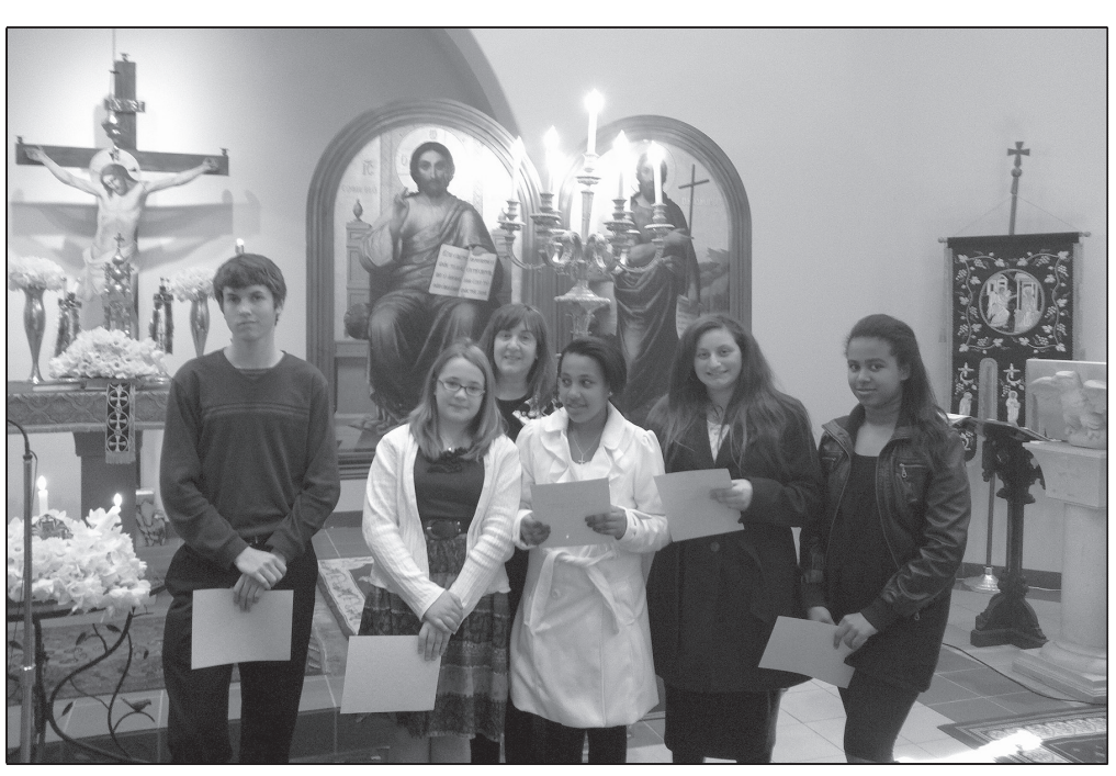
Our Oratorical Festival Participants who competed in 2012. Congratulations to each of them!

Easter as they do in Greece, we can still feast with family during Bright Week, go out to dinner with our families or any other kind of celebration we can think of, all the while chanting X\rho_{I\sigma}\tau \delta_{\zeta} Av \epsilon \delta \tau \eta in our hearts and with our voices. As we celebrate the love that the King of kings, our Lord and our God came to personally bring us, let us remember: "It is the day of the Resurrection; let us then make ourselves resplendent for the festival and embrace one another... Christ is Risen from the dead, trampling death by death, and bestowing life to those in the tombs."