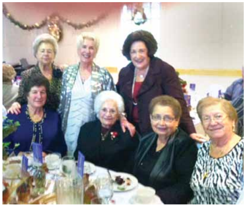
MERRY CHRISTMAS & HAPPY NEW YEAR 2012