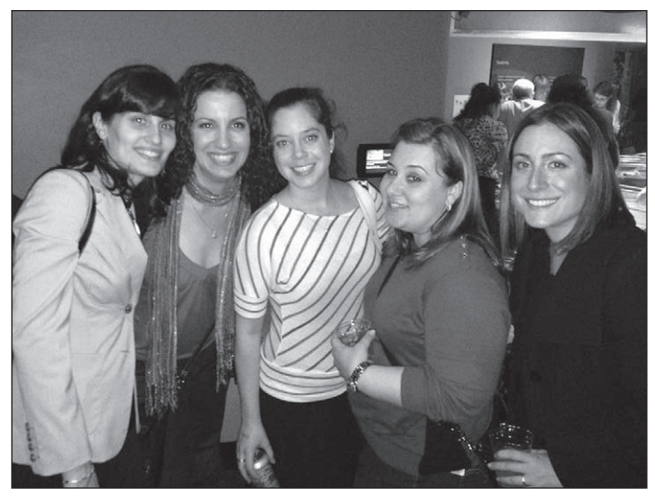
Some of our Young Adult ladies enjoying the evening at an event in February

Parishioners in good standing (that is, those who are ecclesiastically in good standing with the Orthodox Church, as defined in the Archdiocese Regulations, and who have met their stewardship obligations to the Cathedral) may participate in the Parish Assembly. Quorum requirements, as defined in the Parish By-Laws are: 75% of the Parish Council (i.e. 12 out of 15 members), an equal number of other parishioners in good standing, plus the Dean of the Cathedral or, if fewer than 12 members of the Parish Council are present, then 75 parishioners in good standing, plus the Dean of the Cathedral.