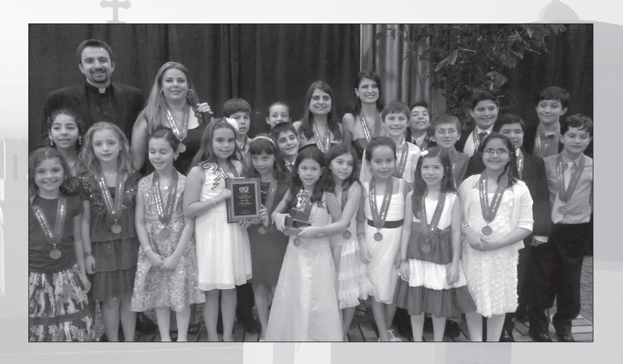
"O Christ our God... Who love the just and show mercy to the sinners; Who call all men to salvation through the promise of blessings to come..." - Prayer from the Great Compline service

NON-PROFIT ORG. U.S. POSTAGE PAID SAN FRANCISCO, CA PERMIT NO. 1734