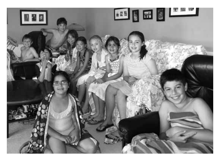
Groups Will Resume This Month!

"You have given me the protection of my salvation, and your gentleness fulfills me." - 2 Kingdoms 22:36