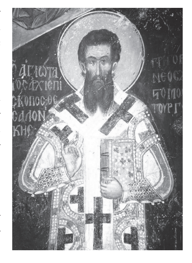
Saint Gregory Palamas

However, secondly, one does not see by mere positive apprehension of discursive or intellectual knowledge either. It is something that is apprehended directly, and beyond both the knowing of reason and the unknowing.