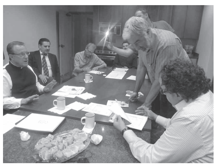
The signing of the contract with McNely Construction on October 16