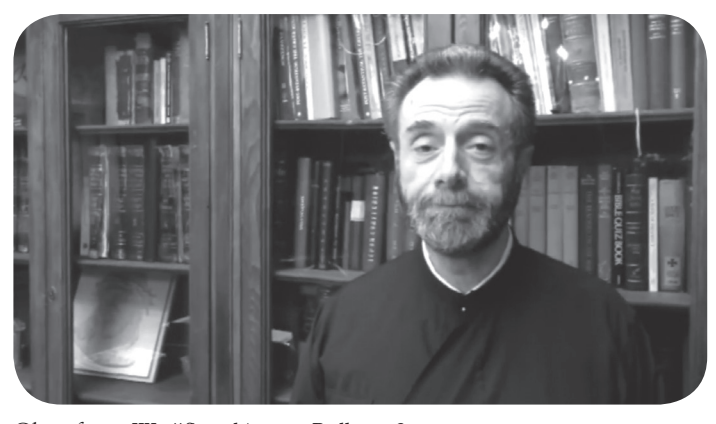
Clips from We #StandAgainstBullying 2