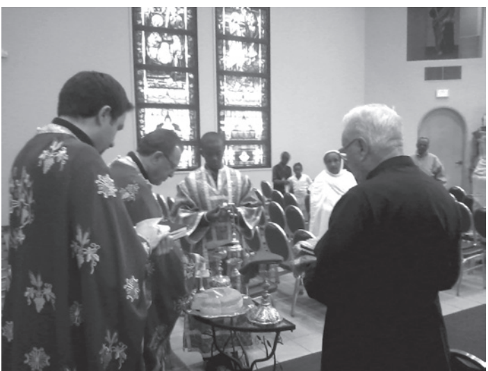
The teaching liturgy