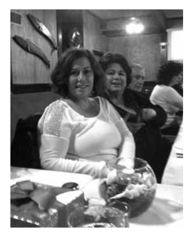
Continued next page

Those of us who attended the Metropolis Philoptochos Light the Path Luncheon in Novato on December 7 enjoyed the warmth and camaraderie of the