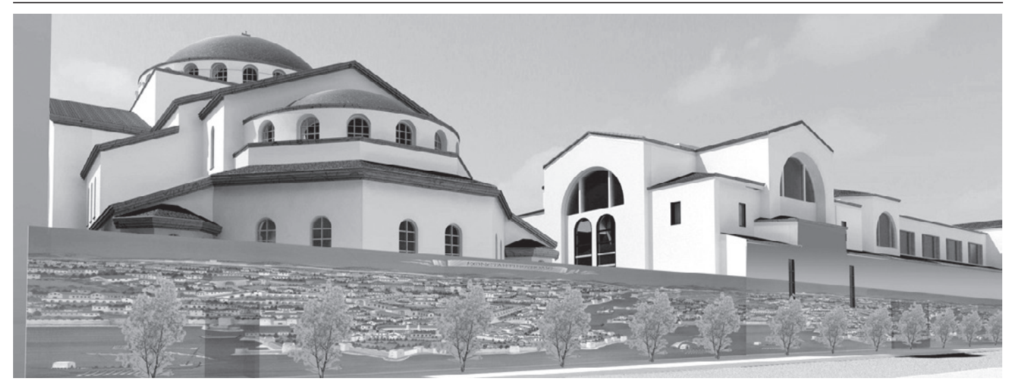
WHAT DOES MY GIFT TO THE BUILDING FUND REALLY AMOUNT TO OVER A FIVE YEAR PERIOD? Below are some different ways to look at how you can make a meaningful gift.