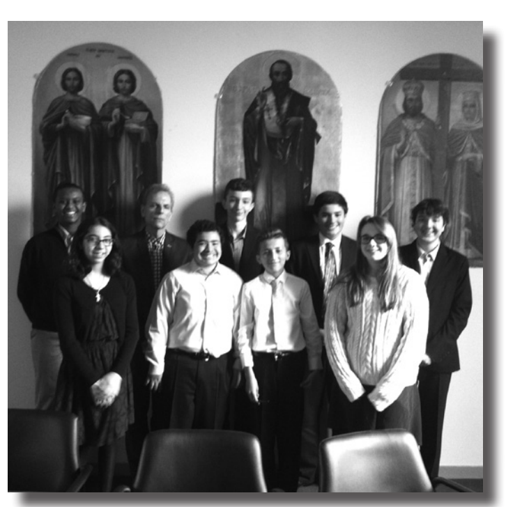
Junior High-High School 2015