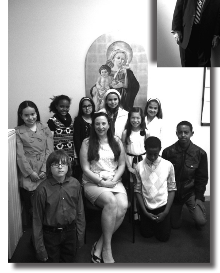
4th-5th-6th Grade 2015