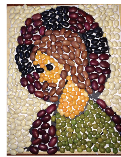
A beautiful icon made by our Sunday School.