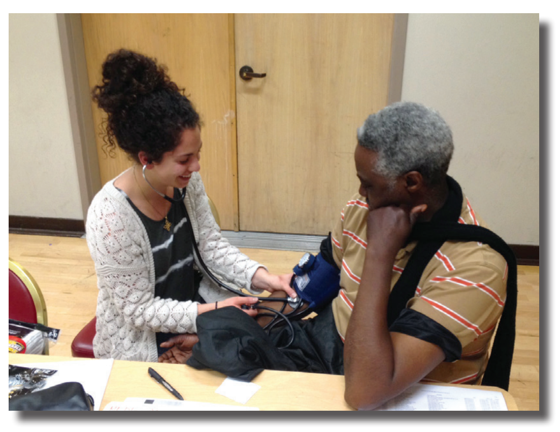
Parish Nurse Program Begins!

This month saw a new inner city ministry launched- the parish nurse program!