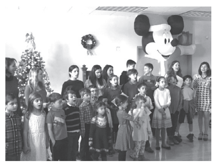
Children of the Cathedral's Greek School, singing the Kalanda during the Christmas program December 19.