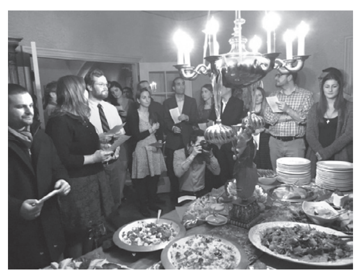
Some of the many Young Adults who attended the Christmas party at the Metropolis House on December 18.