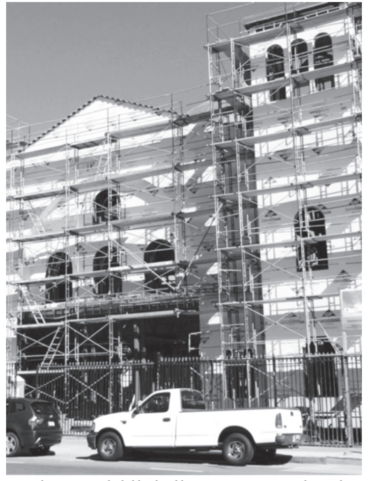
From the exterior, a little like the old Annunciation! Notice the windows and the central peak. Even the towers, for those who remember the bell towers before they were taken down in the 60s. In any case, the exterior is thoroughly Byzantine. It is typical of Orthodox churches built between the 4th and 9th centuries. The interior is something else. Like Orthodox worship itself, it must be experienced.