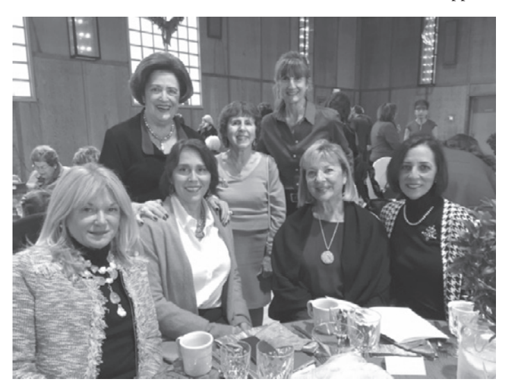
All smiles at the Luncheon December 12

Our Membership drive for 2016 will take place the months of January through March. We look forward to all becoming members of our hard working chapter. We are Philanthropy in action. Look for information that tells all the ministries we support.