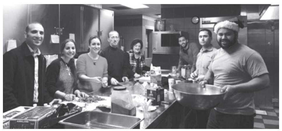
Some of the Soup Kitchen volunteers with His Eminence Metropolitan Gerasimos