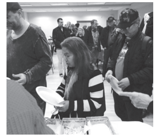
Some of our guests at the Soup Kitchen

learned more about this important ministry. The ministry takes time to shop, to cook, to serve. It involves set-up, take-down, and follow through. In addition to feeding the hungry, the Soup Kitchen ministry has a nurse on hand and gives each guest items to take with them—mostly canned or packaged food items, but items to help keep people warm during this increasingly cold time of year. Thank you, all for, in feeding and for reaching out to the hungry, you are feeding and reaching out to Christ Himself.