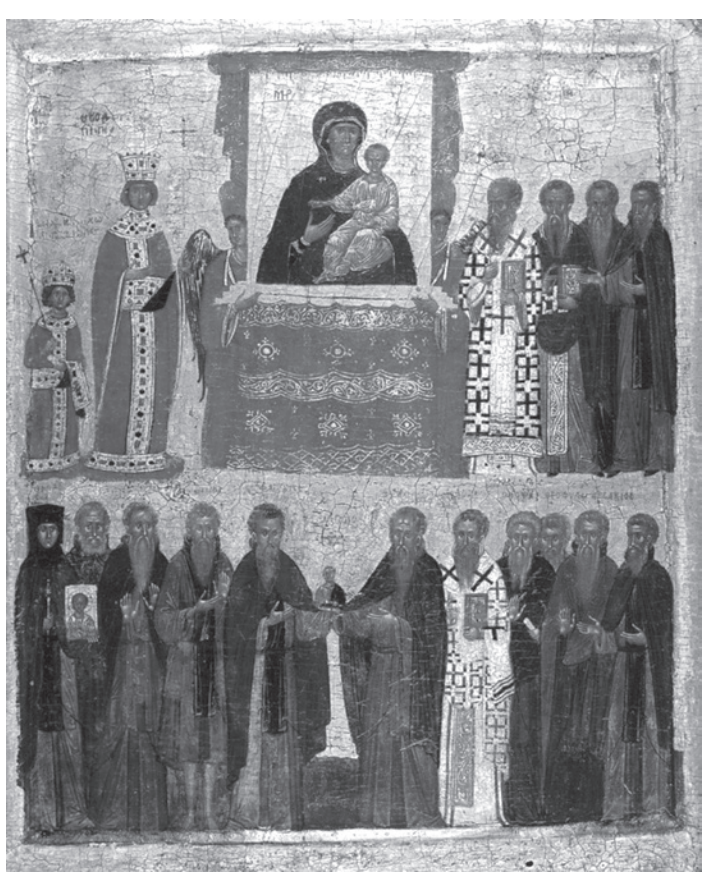
The above icon, referenced above, is known as the "Triumph of Orthodoxy." This event is celebrated in Orthodox Churches the first Sunday during the Great Lent. This year, the Sunday of Orthodoxy falls on March 20.

What this icon visually represents is the end of Byzantine iconoclasm and return of the primacy of the icon. As expressed, icons play a vital role in the practice of Orthodox faith. However, there