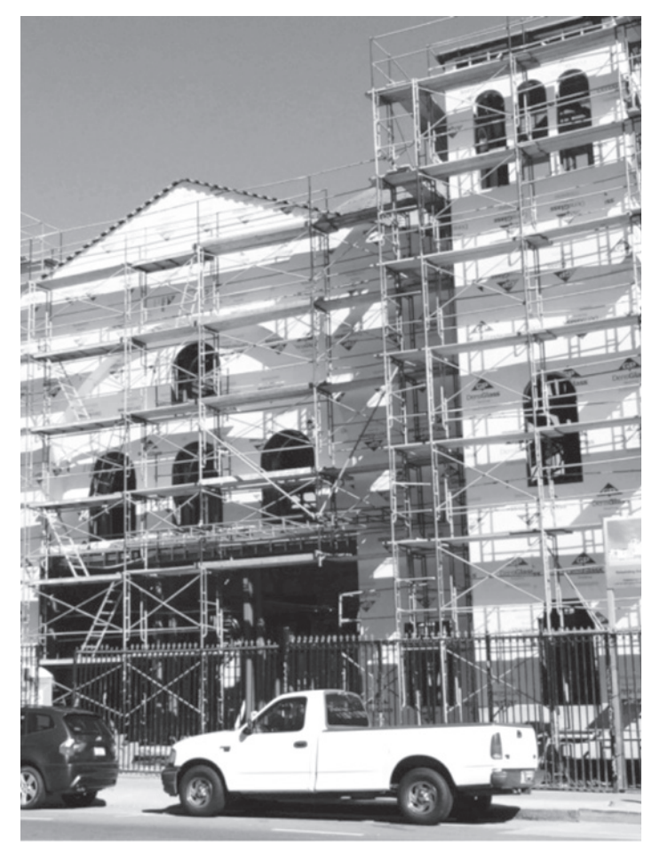
From the exterior, a little like the old Annunciation! Notice the windows and the central peak. Even the towers, for those who remember the bell towers before they were taken down in the 60s. In any case, the exterior is thoroughly Byzantine. It is typical of Orthodox churches built between the 4th and 9th centuries. The interior is something else. Like Orthodox worship itself, it must be experienced.