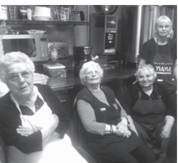
aration for the Vasilopita cut- 45 minutes. ting and brunch on January 10, sponsored by the Ladies Philoptochos.