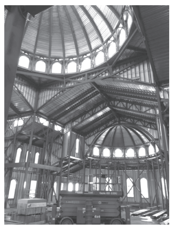
Taken on January 11, this photo shows the interior of the Cathedral, looking east. Fire sprinklers are being installed in the apse and in the dome and, soon, the remaining windows will be installed. The windows, crafted for the Cathedral by Pella, 135 in all, are metal on the outside and oiled walnut on the inside. Together with the mahogany details, they will provide warmth against the stone, steel, marble and concrete finishes.