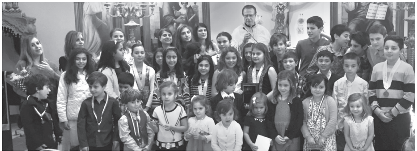
Our groups presenting their medals following this year's FDF.