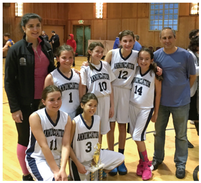
Our girls team—MVP in sportsmanship!

improved dramatically throughout the season and finished with a trip to the championship game where they ultimately took second place. Our middle school boys team also went to their championship game where they won a thrilling game to take home first place. We are proud of all of our children. Go Annunciation!