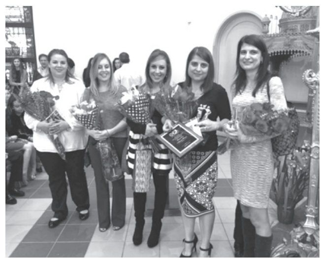
Our dedicated directors.