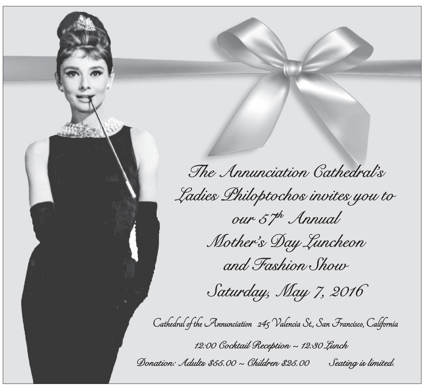
PLEASE RETURN THIS PORTION IN THE ENCLOSED ENVELOPE BY MAY 2, 2016 Make Checks Payable to: Ladies Philoptochos