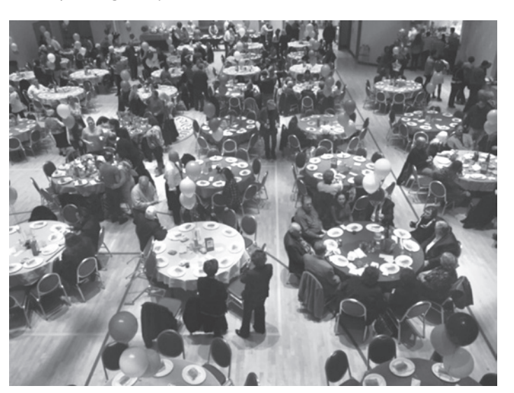
A bird's eye view of the Crab Feed.

Χριστὸς ἀνέστη ἐκ νεκρῶν, θανάτῳ θάνατον πατήσας καὶ τοῖς ἐν τοῖς μνήμασι ζωὴν χαρισάμενος.