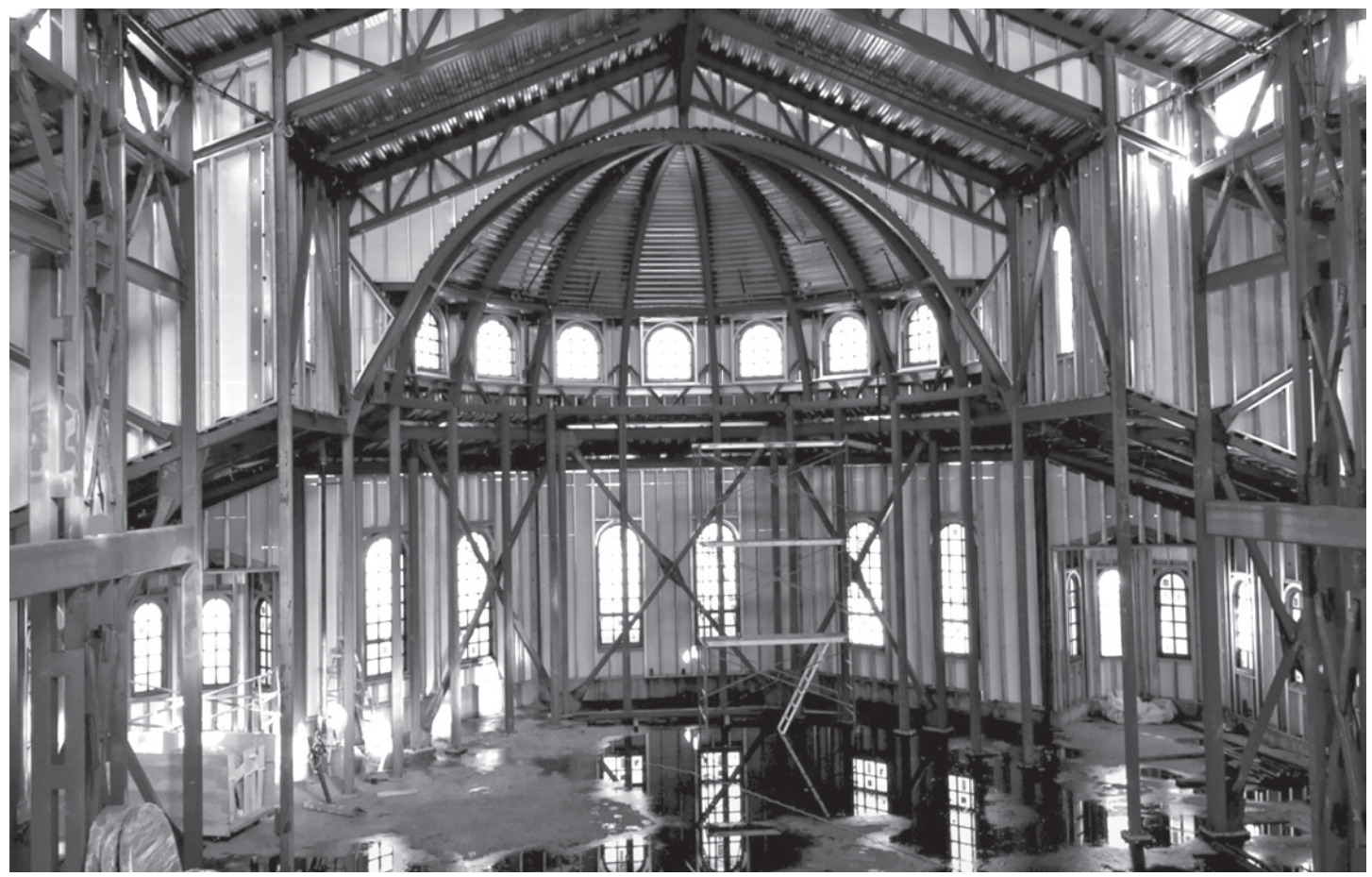
The Ieron Dome.