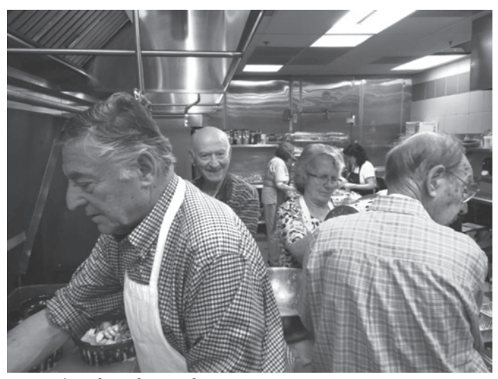
Some of our legendary cooks!

Copy and paste this message in a Tweet: Amazon donates to Annunciation Greek Orthodox Cathedral when you shop @AmazonSmile. http://smile.amazon.com/ch/94-2702215 #YouShopAmazonGives