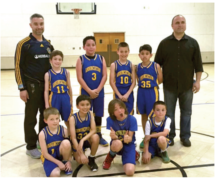
Our boys elementary team. Great job!