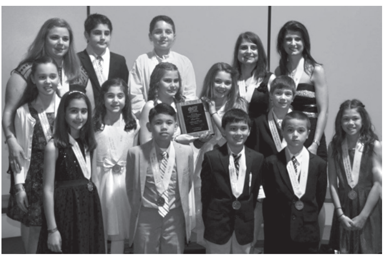
Rewarded for all their hard work.